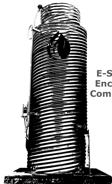
E-Series Enclosed Combustor