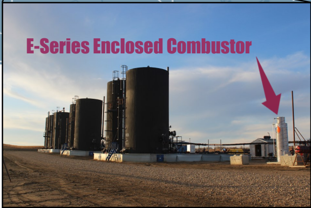
Photo showing E36-12 Combustor installed on Rife Resources Ltd. CHOPs site